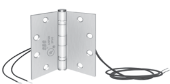
PTH x 5 Ft Cable And Door Position Switch