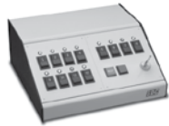
TCC AL8 AL4E