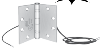
PTH x 5 Ft Cable