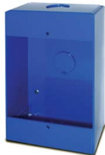
492-BB Dimensions: 4.750" H x 3.125" W x 1.625" D