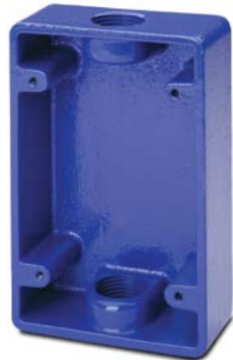
491-BB Dimensions: 5.25" H x 3.25" W x 1.5" D