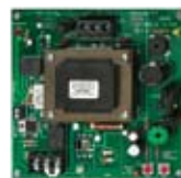
631RFL 1.5 Amp Power Supply Less Box

631RFA: 16"W x 14"H x 6.5"D (406.4 x 355.6 x 165.1mm) Material: Steel, 16 Ga., (1.52mm)