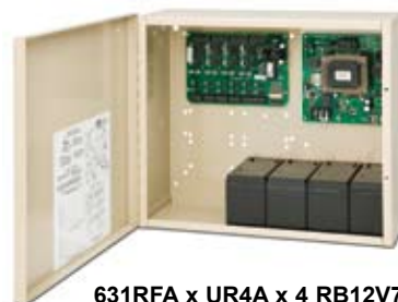
631RFA x UR4A x 4 RB12V7