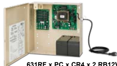
631RF x PC x CR4 x 2 RB12V4