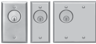
700 700N 700T

Key switch assemblies compatible with 1.125" and 1.25" U.S. standard mortise cylinders (not included).