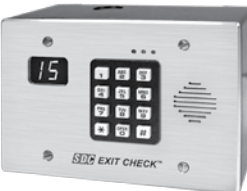
101-DE with DEC-J