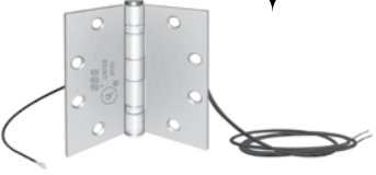
PTH x 5 Ft Cable