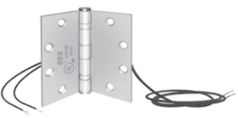
PTH x 5 Ft Cable And Door Position Switch