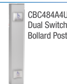
CBC484A4U Dual Switch Bollard Post