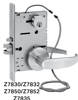
Z7830/Z7832 Z7850/Z7852 Z7835